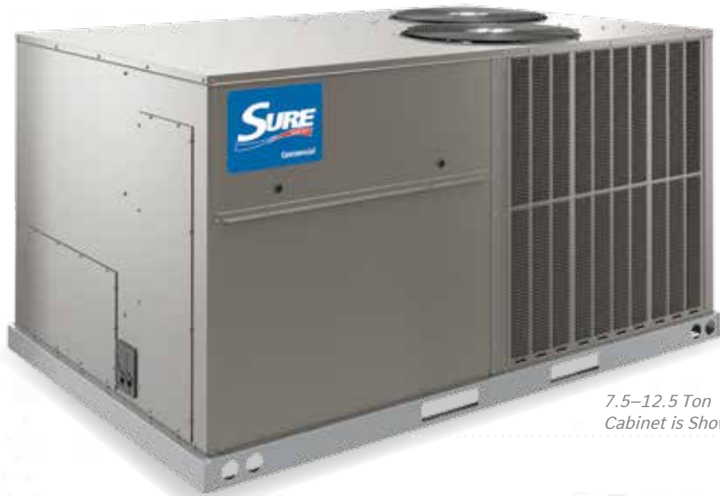
7.5–12.5 Ton Cabinet is Shown

:: CUSTOMIZED SOLUTIONS TO HELP GROW YOUR BUSINESS.