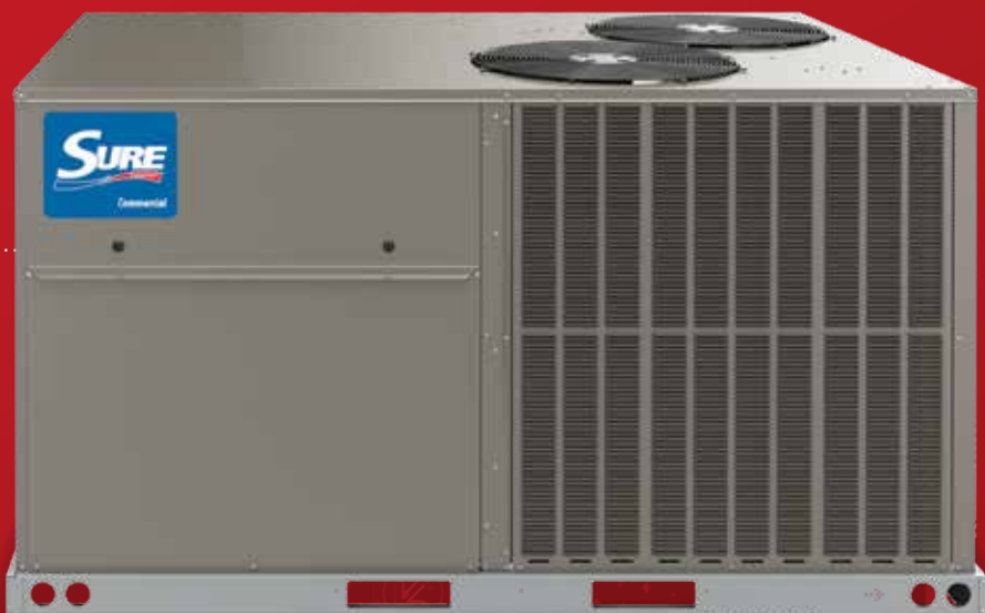
7.5–12.5 Ton Cabinet is Shown

With industry-leading efficiencies of up to 14.8 IEER, the Renaissance Line may qualify for a variety of utility rebates—helping your business realize substantial savings for a greater return on investment, at purchase and year after year.