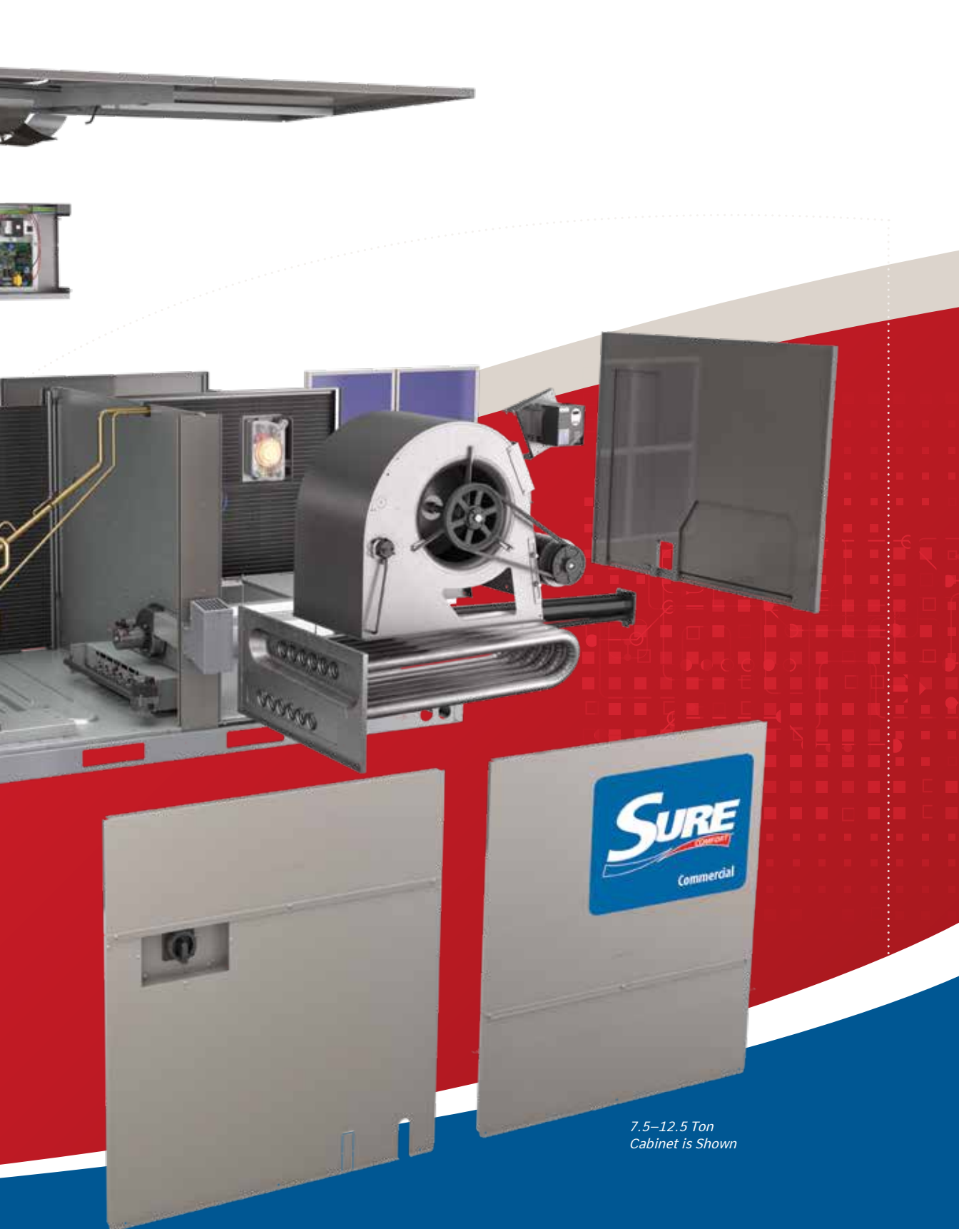
7.5–12.5 Ton Cabinet is Shown