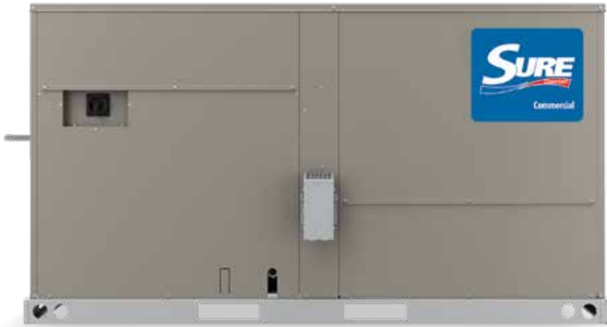
7.5–12.5 Ton Cabinet is Shown

Redesigned for today's demanding commercial applications, the Renaissance™ Line is packed with smart thinking—like high-quality critical components, lean manufacturing processes and robust design features—including the strengthened, solid, single-piece top, durable panels, plus Scroll™ compressor technology. Sure Comfort® offers inventive engineering that delivers easy installability, smart serviceability and industry-leading efficiencies for uptime dependability in a wide range of rooftop environments.