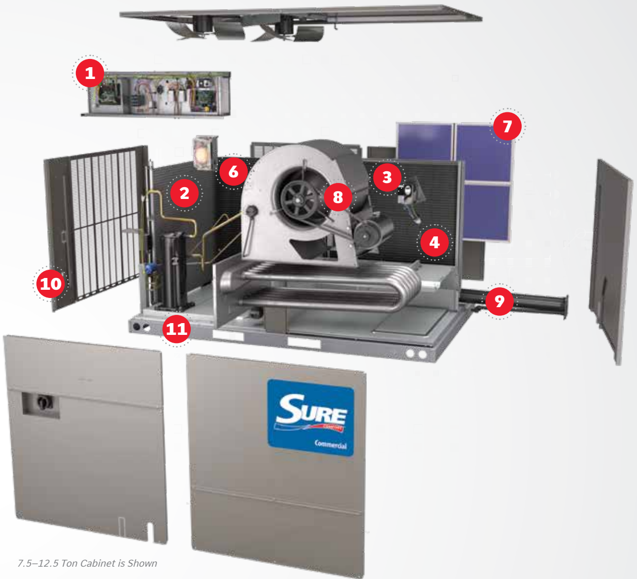
7.5–12.5 Ton Cabinet is Shown