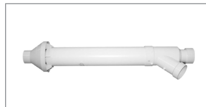
Concentric Vent Termination (SP20897, SP20245, SP20796)