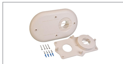
Flat Vent Termination (SP20285, SP20286)