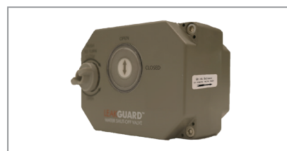
Shutoff Valve (SP21172)