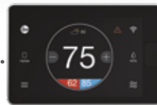
EcoNet Smart Thermostat