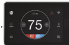
EcoNet Smart Thermostat