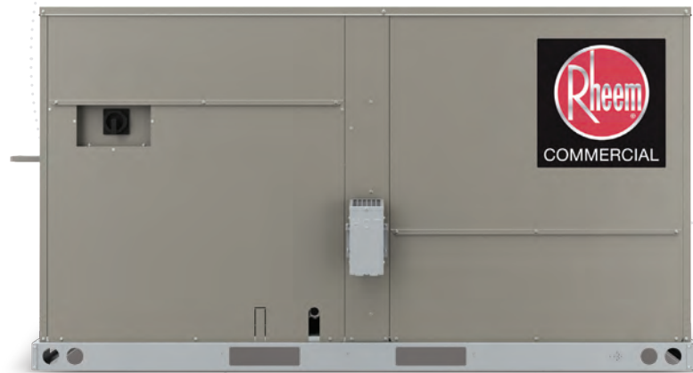
7.5–12.5 Ton Cabinet is Shown

Based on inspired thinking and innovative problem solving— a refined solution to enhance productivity.