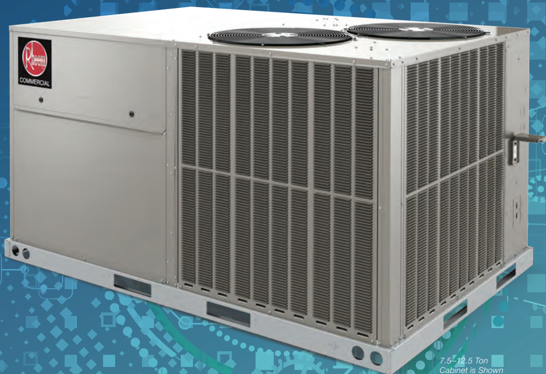
7.5–12.5 Ton Cabinet is Shown

7.5–12.5 Ton Package Air Conditioners (RACDZT, RACDZS, RACDZR)