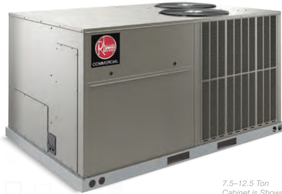
7.5–12.5 Ton Cabinet is Shown

:: customized solutions to help grow your business.