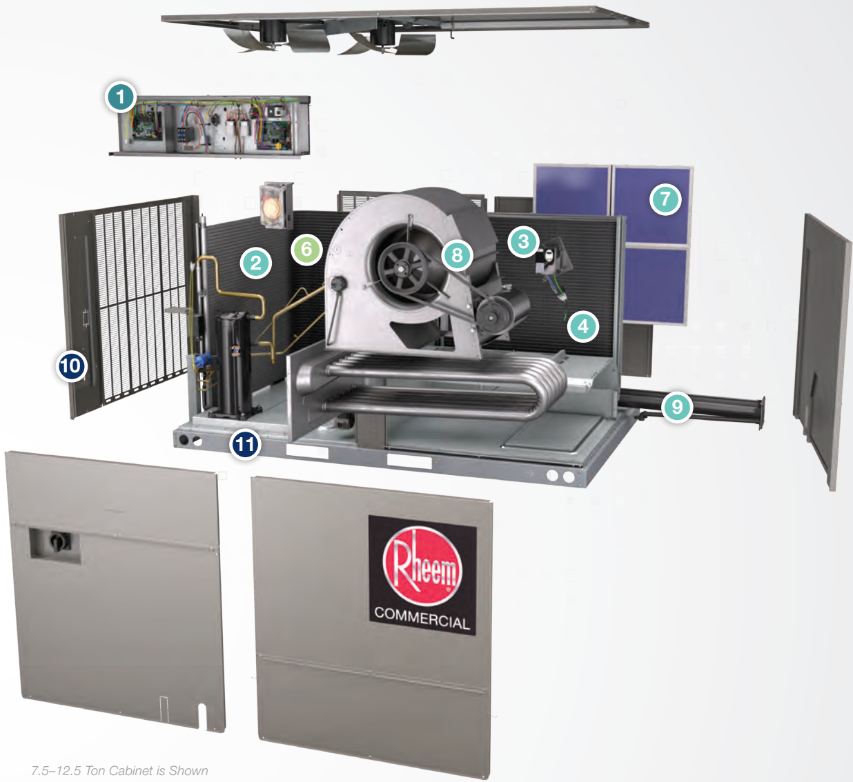
7.5–12.5 Ton Cabinet is Shown