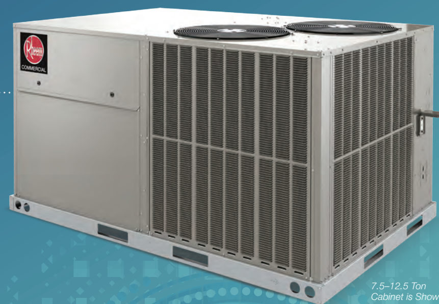
7.5–12.5 Ton Cabinet is Shown

With industry-leading efficiencies of up to 14.8 IEER, the Renaissance Line may qualify for a variety of utility rebates—helping business customers realize substantial savings for a greater return on their investment, at purchase and year after year.