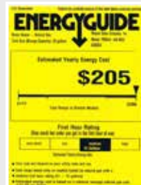
ENERGY GUIDE LABEL

The updated testing procedures enable a more accurate approximation of what it will cost to run a particular water heater.