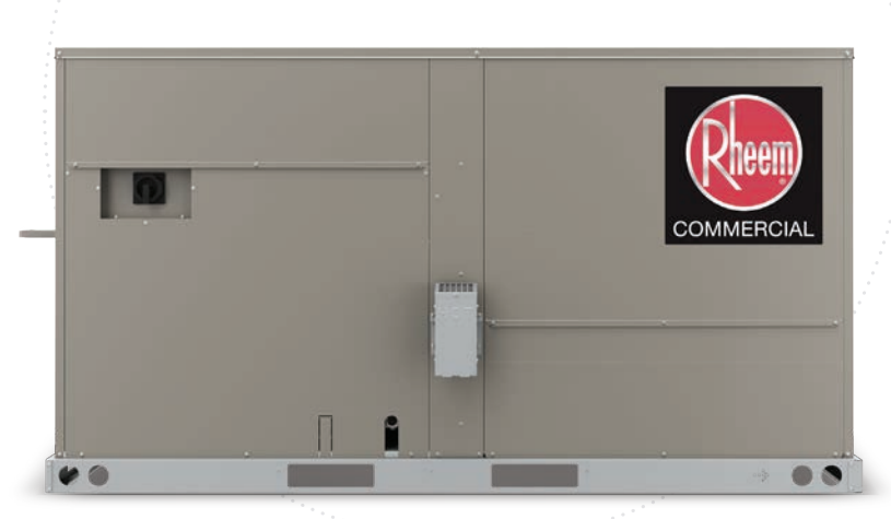
7.5–12.5 Ton Cabinet is Shown

A refined solution to make replacement, installation and service faster and easier.